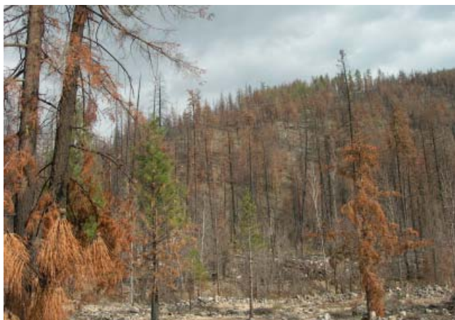
Two years after the Tripod Fire north-central Washington, the area is used for both nesting and as a source to feed on bark- and wood-boring beetles by black-backed woodpeckers.

In this research, nest surveys and monitoring of black-backed woodpecker populations were conducted annually during the first four years after wildfire at three ponderosa pine forest sites. Fire sites used were the 1994 Star Gulch Fire in west-central Idaho, the 2002 Toolbox Fire in south-central Oregon, and the 2006 Tripod Fire in north-central Washington. Lewis's and white-headed woodpeckers were also monitored at the study sites where they occurred; Idaho and Oregon for Lewis's woodpecker, and Oregon only for white-headed woodpecker.