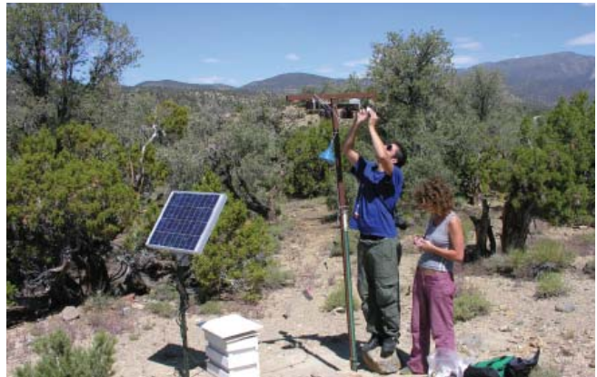
Researchers change passive samplers for O_3 , NO_2 , NO , NH_3 and HNO_3 at the White Mountains monitoring location.

the Sierra Nevada and into Owens Valley, the deep rift valley east of the Sierra Nevada.