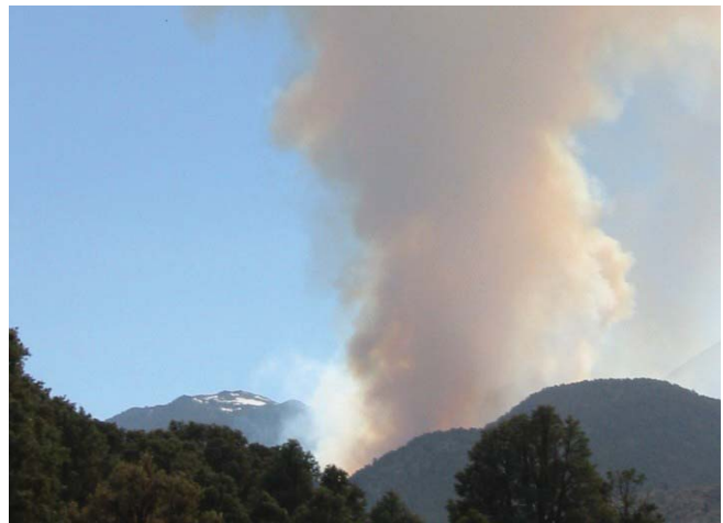
Data from the coordinated monitoring network in the Sierra Nevada improves the understanding of the effects of wildland fire on air pollution levels. Photo shows plume from a wildfire in Humboldt-Toiyabe National Forest in 2002.