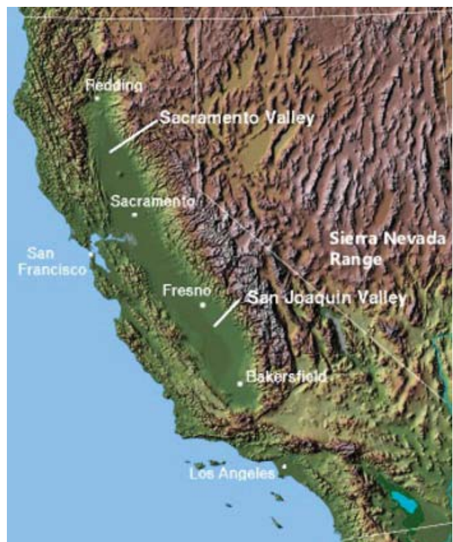
Map shows the location of the San Joaquin Valley relative to the Sierra Nevada range, and other California reference points.

The San Joaquin Valley is recognized as one of the most polluted areas in the U.S. Related air quality problems reach into federally managed lands in the Sierra Nevada, including Yosemite and Sequoia and Kings Canyon National Parks, and several national forests. In 2003, these areas experienced 72 days of exceedances of the 8-hour health standard for O_3 . Because wildland fires can contribute to high levels of O_3 and PM, the additive effect of fires in these areas is an air quality management issue.