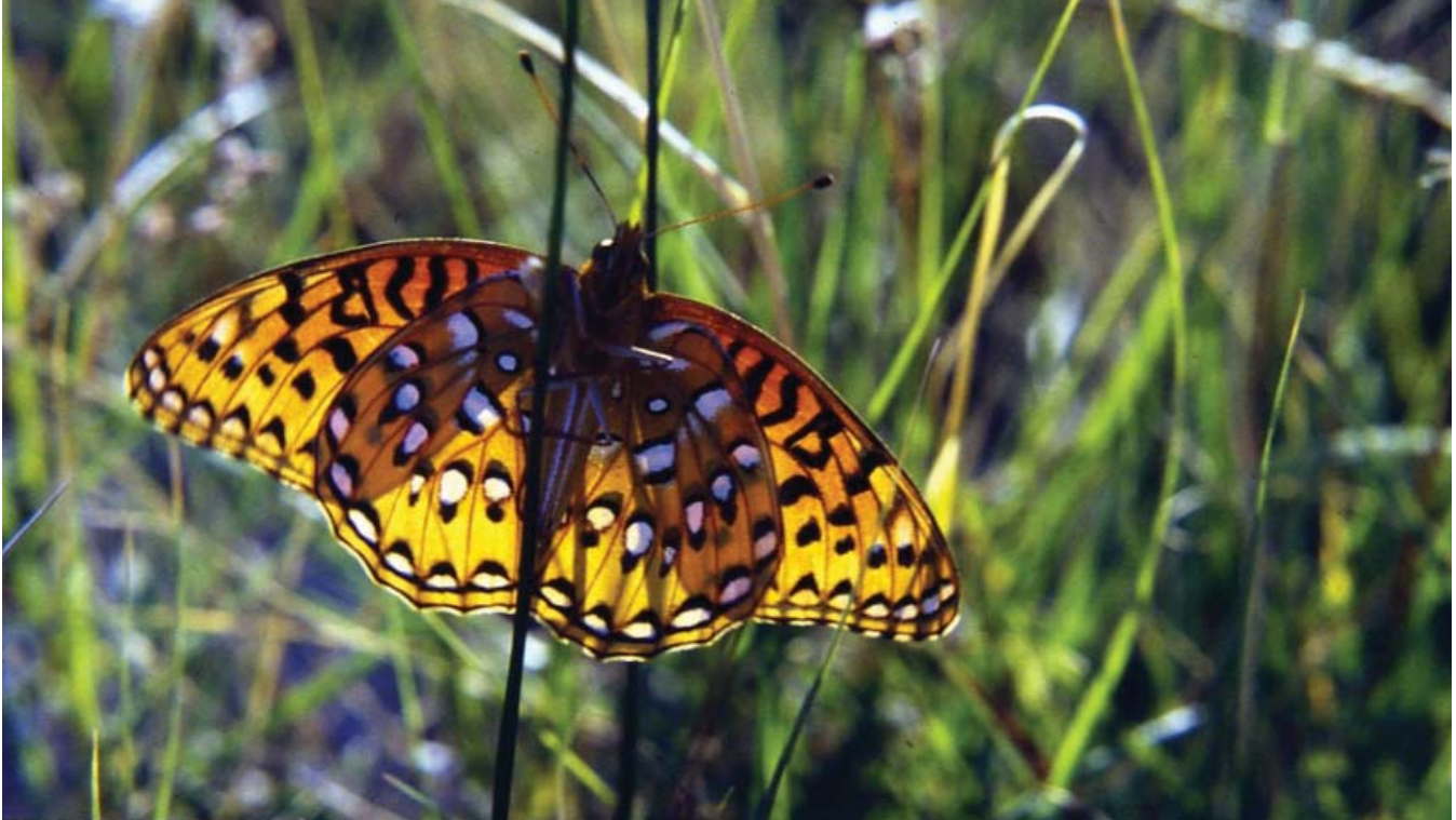
Speyeria nokomis apacheana, a butterfly that occupies seeps, springs, and riparian areas in the central Great Basin.