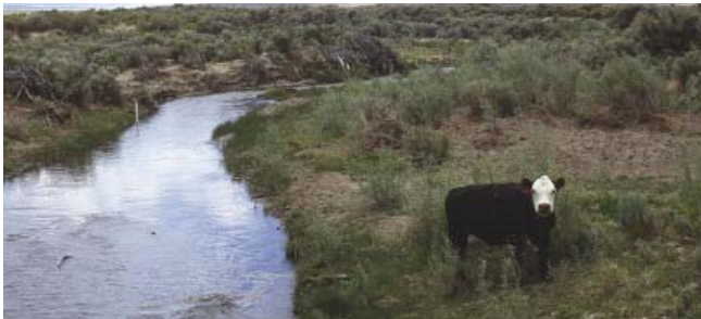
Cow grazing along the Reese River, Lander County, Nevada.

The pattern of grazing has changed over time. In the middle decades of the 20 th century, ranchers began to graze more cattle and fewer sheep. “Cows can’t go as far as sheep from water sources, so they congregate along the riparian zones eating the vegetation,” says Dobkin. There is general agreement that across the entire western United States, the current extent of riparian land cover is less than half its extent before the mid 1800s. “Riparian habitat is absolutely critical for breeding birds and during migration.”