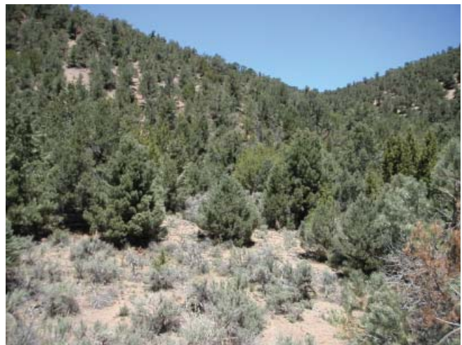
Pinyon-juniper woodland in Underdown Canyon, Shoshone Mountains.

At the same time, pinyon and juniper woodlands are expanding into some areas once dominated by sagebrush and other shrubs, grasses, and forbs, and non-native cheatgrass has colonized extensive areas.