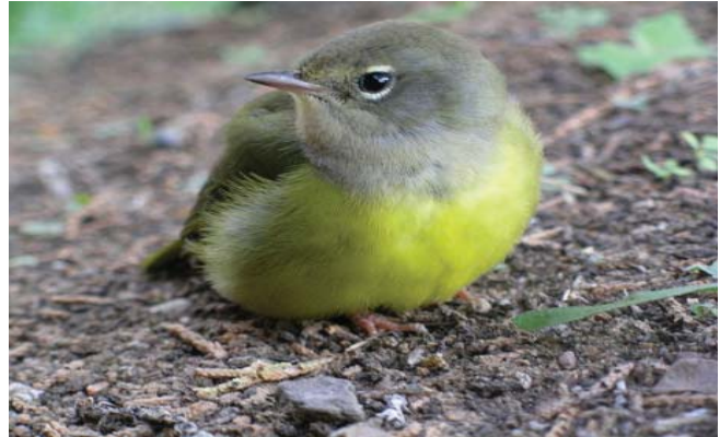
MacGillivray's Warbler ( Oporornis tolmiei).

willow canopy and a diverse understory including wild rose, currant, and snowberry. MacGillivray's Warbler is associated with low riparian shrubs in the understory. Although latitude and elevation explained some variation in the occurrences of these three species, some year-to-year changes in abundance also were associated with weather. Abundances of the three species, especially Song Sparrow, were lowest in 2005. Total precipitation during the plant growing season was greatest—and mean temperatures during March, April, and May of the reporting year the coldest—of the six years examined for this analysis. These results establish a baseline of variation over time in distribution and abundance of birds in the absence of fire.