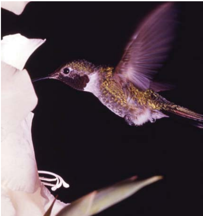
Broad-tailed Hummingbird ( Selasphorus platycercus ).

Other analyses focused on data for three migratory, riparian obligate species detected during point counts in the Shoshone Mountains and Toiyabe and Toquima ranges: MacGillivray's Warbler, Broad-tailed Hummingbird, and Song Sparrow. The vegetation at the bottom of the canyons where data were collected was primarily aspen, willow, pinyon and juniper, and sagebrush.