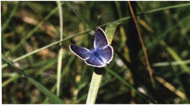
The larvae of Plebejus saepiolus feed on Trifolium , a plant that grows primarily in riparian areas.