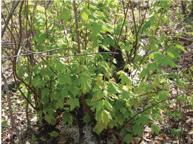
Prolific sprouting of red maple after a burn.

soil samples beneath the canopy. She found that the quantity of throughfall water was up to 9 percent lower under maple than under oaks, but stemflow under red maple was two to three times greater due to the smooth bark of the maple compared to the grooved bark of oak. Not only does this give red maple an edge in water utilization, but stemflow also delivers nutrients and promotes nitrogen cycling in underlying soils, likely giving red maple a nutrient boost.