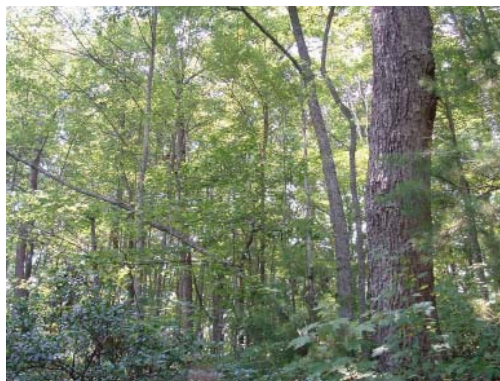
A dense unburned stand on Whittleton Ridge, KY.