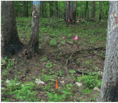
Study plot near Morehead, KY, showing seedlings flagged as part of long-term research to quantify seedling survival and growth in response to prescribed fire.

Overall, single and repeated burning temporarily opened the canopy to a small degree, but those effects were quickly negated by resurgence of cover during the following growing season. Burning did not improve the survival of white oak or red oak seedlings compared to unburned treatment, with one exception. Seedlings in the red oak group on one site that burned more severely than planned showed a positive response, a 25 to 30 percent increase in height and basal diameter, but the seedlings in that burn were initially larger than those on the other sites and more of the canopy was opened by the severity of the fire. “The areas with the most intense burn had the most prolific oak growth,” says Heather Alexander, a post-doctoral associate at the University of Florida, “but that type of fire is not part of the management scenario.” A hot fire that kills off overstory trees creates a better light environment, “but it is tricky. Fire is not a precise tool.”