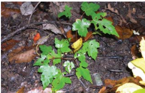
Red maple seedling.

With single and repeated burn treatments, red maple seedling mortality was significant, about 60 percent, but seedlings surviving the fire grew quickly after treatment. Root suckering sassafras survived both fire treatments and grew more vigorously than on unburned sites.