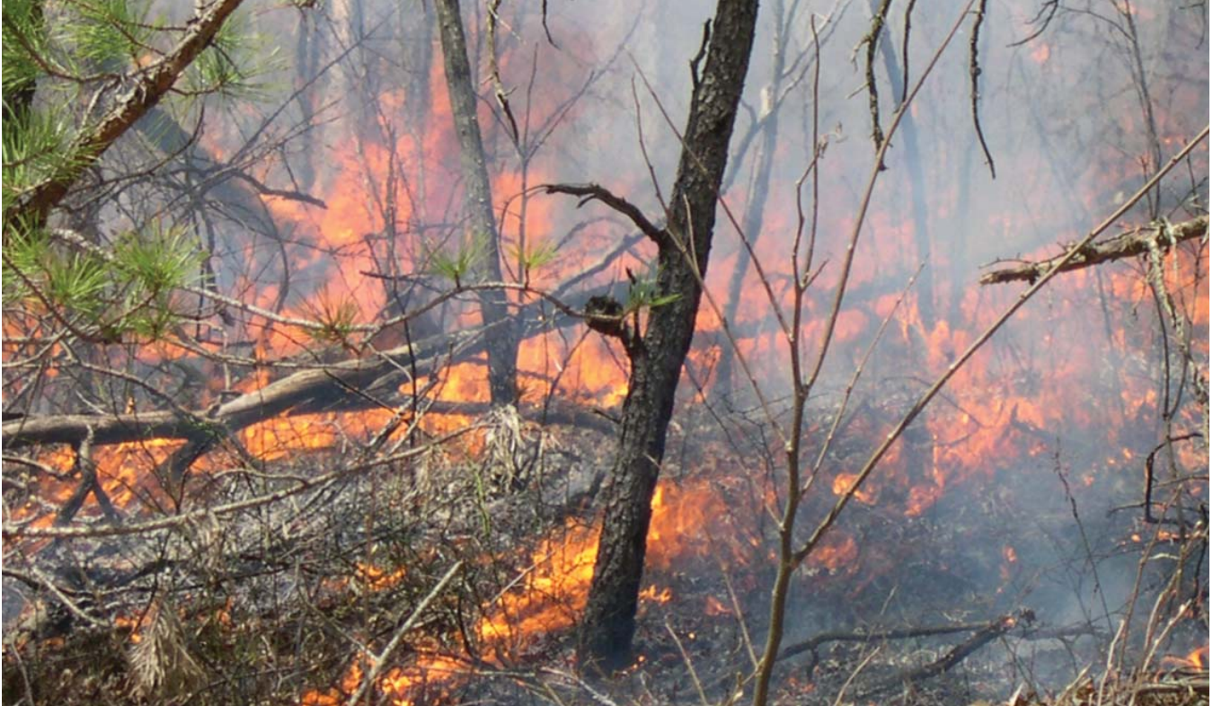
A burn at Buck Creek, one of the study sites.