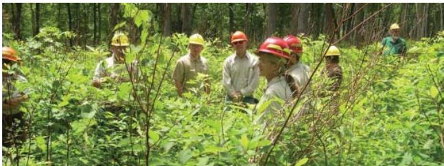
Prolific re-sprouting by sassafras on a plot near Morehead, KY, which burned three times between 2002 and 2007.

The Forest Service began acquisition of what is now known as the Daniel Boone National Forest in 1937, the same era that ushered in active fire exclusion. As the forest matured in the absence of major harvesting or fire, the amount of sunlight that reaches the forest floor dwindled as woody species in the subcanopy proliferated. Shade-intolerant and fire-tolerant young oaks now face competition from a number of other native trees, including red maple and sassafras, two species that can tolerate low levels of sunlight and are also theoretically more sensitive to the effects of fire than oak. In practicality, however, though maple has thinner bark than oak, it resprouts vigorously soon after fire and competes with oak seedlings and saplings for nourishment and light. Sassafras also quickly rebounds after fire through prolific root sprouting.