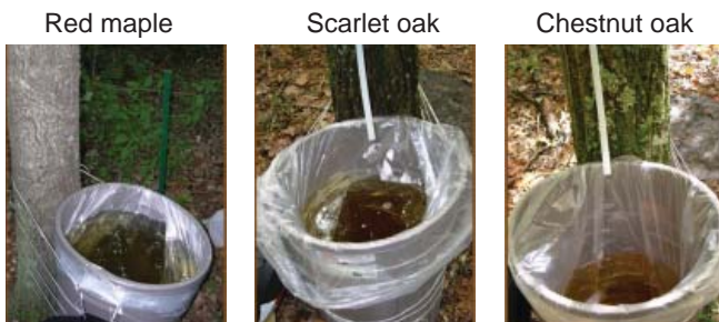
One two-inch rainfall event generated nearly 38 gallons from a red maple tree compared to 22 and five gallons from scarlet and chestnut oak, respectively. Credit: Heather Alexander.

Though trees are not generally considered a migratory species, they do slowly move in response to changes in climate, hydrology, and soil chemistry. A hotter, and perhaps drier, climate could theoretically favor oaks, which have an extensive root system that helps them survive drought. Red maple, however, may be able to “outsmart” the oaks in this and other ways.