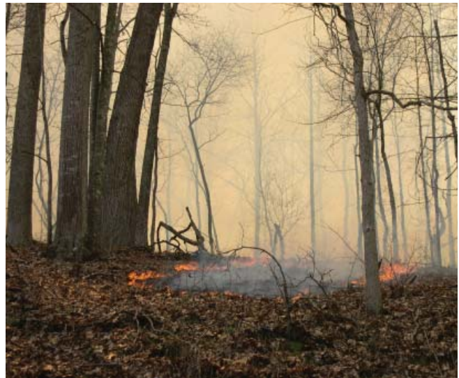
Buck Creek Burn, April 2006.

The six-year round of studies was conducted between 2002 and 2007 on ridgetop and cove landscapes that ranged from dry to moist (sub-xeric to sub-mesic). The three study sites—located at Buck Creek, Chestnut Cliffs, and Wolf Pen—were divided into three sub-sites each, unburned control, infrequent burn schedule, and frequent burn schedule.