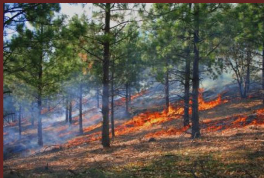
Prescribed fire in the Red Mountain fuel treatment area, Sequoia National Forest, California.