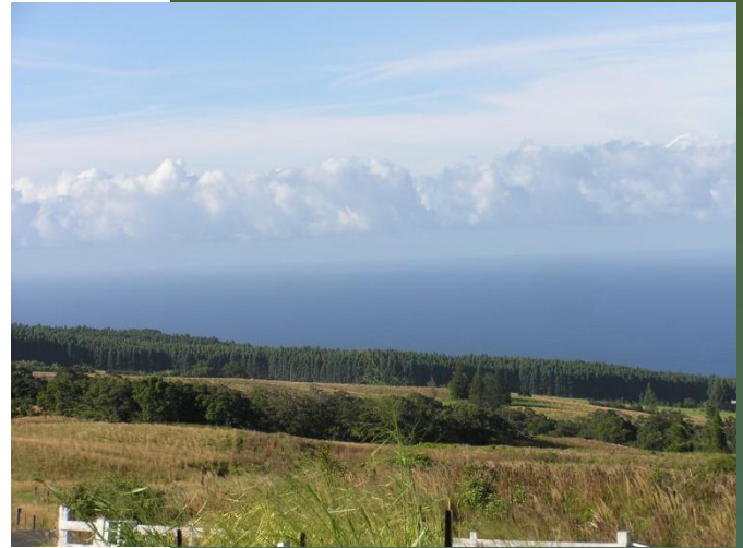
Hawaii Experimental Tropical Forest (HETF)

Provided specialists in wildlife biology, hydrology, and archeology.