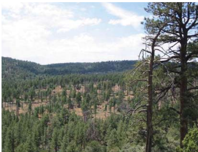
Mt. Trumbull study areas included a treated forest landscape (foreground) and an untreated control landscape (background).

Model simulations were projected in 10-year increments for 100 years into the future (2008–2108) using the Central Rockies/Southwestern Ponderosa Pine variant of FVS. The maximum stand density index when ponderosa pine composed 81–100 percent of the stand was 514 trees per acre, assuming trees of 10 inches dbh.