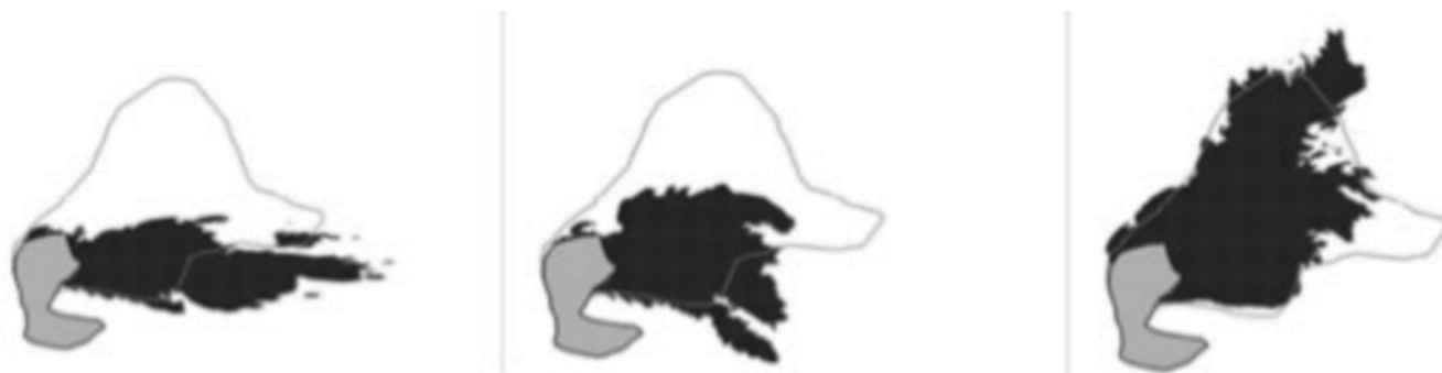
This graphic shows fire growth predictions from the model reconstructions of the 1994 South Canyon Fire, west of Glenwood Springs, Colorado. The uniform wind field is on the left, the WindNinja wind field in the center, and the WindWizard wind field at right.