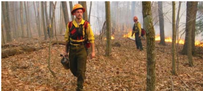
Ridge ignition on the Daniel Boone National Forest.

Third, further study must be conducted on the seasonality of habitat use and the effects of fire. Which parts of the landscape are bats using and when? What constitutes high-quality foraging habitat? We need to find answers to these questions because when bats are entering hibernation, they need to put on weight quickly, and when they emerge from hibernation, they have very low energy reserves. Maintaining high-quality foraging habitat near hibernacula therefore becomes greatly important. Moreover, protecting and improving the critical foraging habitat near hibernacula may help to alleviate the high mortality rates resulting from white-nose syndrome by helping those that do live to survive.