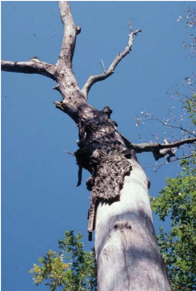
Indiana bat maternity roost.

spread downhill at low intensities and self-extinguish on middle and lower slopes. In addition to keeping prescribed burns to lower intensities, ridge ignitions specifically target the drier areas on landscapes where oaks tend to occur, leaving wetter areas unburned.