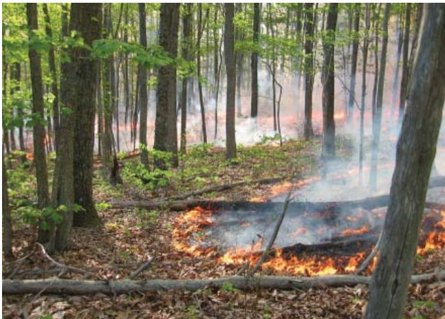
Spring prescribed fire on the Daniel Boone National Forest.

The number of good days for burning in the Central Hardwoods during the late winter and spring can be few. The weather is often wet and, as April turns into May, burning gets risky in terms of harming wildlife such as the Indiana bat, which is emerging from hibernation and migrating back to the area.