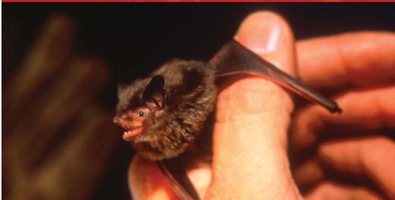
The Indiana bat ( Myotis sodalis ). Credit: Rich Fields.