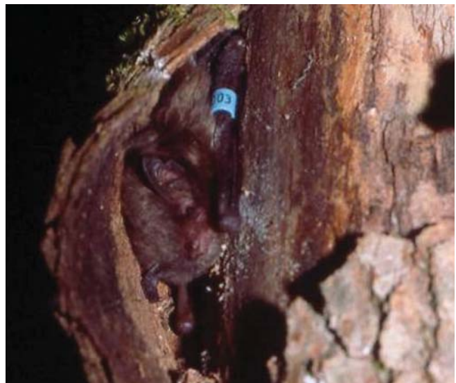
Roosting male Indiana bat, Daniel Boone National Forest.

This particular study used data from prescribed fires in southeastern Ohio and eastern Kentucky and models of carbon monoxide and heat effects. Collaborators included the Rochester Institute of Technology, Ohio University, Norris Consulting, and the Northern Research Station. The research was funded by the Joint Fire Science Program (JFSP) in 2005 and was completed in 2009.