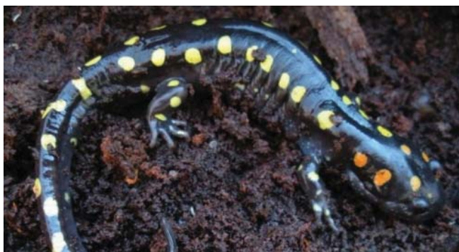
Spotted Salamanders ( Ambystoma maculatum ) live in forested uplands for most of the year yet migrate to isolated wetlands for breeding each spring.