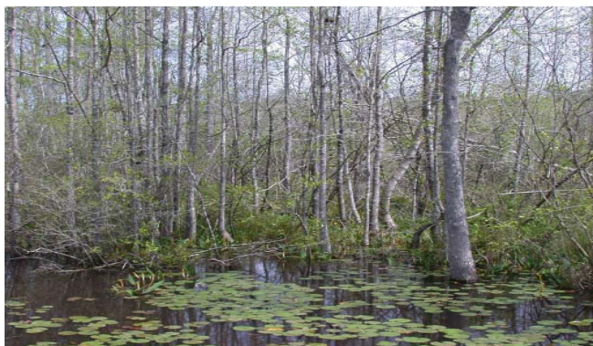
The Oakmulgee District is a kaleidoscope of habitat types. These imposing black tupelo swamps lie scattered within a diverse matrix of longleaf pine and mixed hardwood forests.

In the tropics, disease has taken a harsh toll on amphibians. In the United States, the situation is less dire, but the presence of a fungal pathogen ( Batrachochytrium dendrobatidis ) in several states could prove deadly for many species. For now, California and Alabama are still rich in amphibian species. "Alabama is the number one hot spot in the country for amphibians," says Rissler. California and Alabama also lead the country in extinctions of amphibians. In California, the threats include habitat loss from development and expansion of invasive species. In Alabama, threats include hydroelectric projects, coal mining, and pollution that compromise the integrity of aquatic systems. For the herps that inhabit the rare, fire-dependent upland longleaf pine ecosystem, the absence of fire and expansion of hardwood forest are also threats.