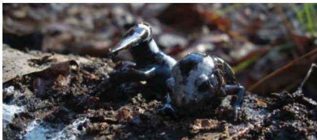
The marbled salamander ( Ambystoma opacum ) breeds in fall in temporary ponds downslope from longleaf pine stands.

Worldwide, the herpetofauna are in decline. Amphibians, which include salamanders, frogs and toads, and the legless caecilians, are at particular risk, with an estimated one third of the total species at risk of extinction. Amphibians are exquisitely sensitive to environmental insults, in part because most have skin that is permeable to water and air, and also because many have a biphasic life cycle; that is, they spend part of their life as aquatic residents and part of their life as terrestrial denizens.