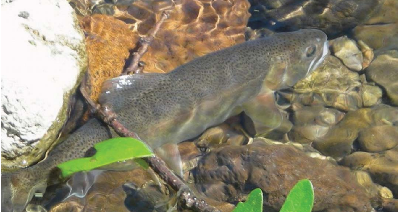
Gila trout.