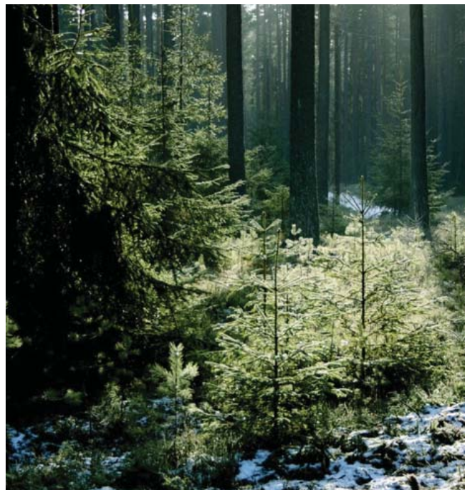
(Top) Silvicultural practices that harvest trees for lumber products often leave even-aged stands. (Bottom) Uneven-aged stands like that shown above promote healthier forest ecosystems for plants and animals by containing trees of different ages, species, sizes, health conditions, stand densities, and habitat opportunities.