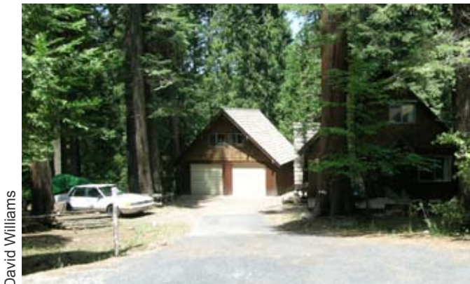
Typical home with high fuels in Grizzly Flat, California.

"We want you to take responsibility for managing your fire risk."