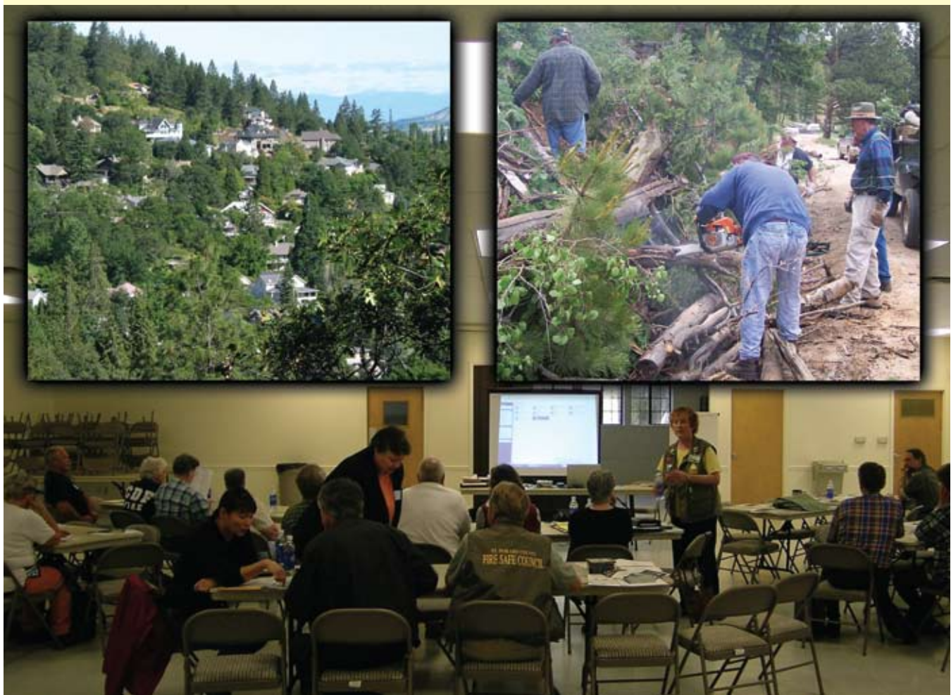
WUI communities develop their own wildfire-protection plans—and improve community capacity in the process.

A Joint Fire Science Program-sponsored research team studied 15 communities as they developed CWPPs. They found that social networks, learning communities, and community capacity were key indicators of success, and that working together on a CWPP can enhance a community's capacity to collaborate, helping it address future challenges more skillfully.