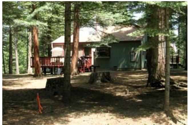
Typical home in Grizzly Flat, California, after cleanup of fuels.