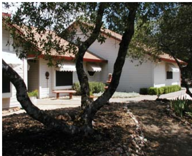
Landscaping around the Cave's home: Reducing structural ignitability merges appropriate building materials and architectural design with fire-wise landscaping.